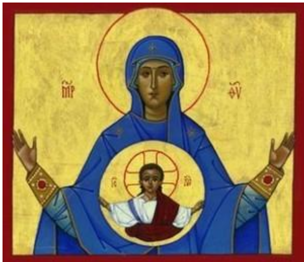
The icon of “The Sign”

The worldly are making themselves busy in the shops and on the internet buying all sorts of rubbish and rich foods that will be left to one side once the Feast comes! The shops have been filled with Christmas Party food for weeks already and carols have been played on the radio since the middle of November!