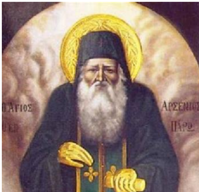
(St. Arsenios of Paros +1877)

In Louth the patron is St. Aethelheard – one of the saints in Lincolnshire and once Archbishop of Canterbury.